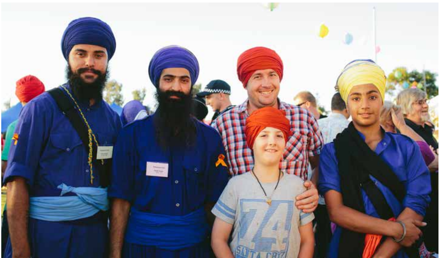
Emerge at Twilight Festival, Shepparton, 2015

St. Georges Road Food Festival was driven by the people down at St. Georges Road. They’re proud of their little precinct. They want to celebrate it with the rest of the town.... The ideas that they come up with are quite amazing, to sit down in a community meeting where people are so open with ideas... (see longer description, Appendix 4).