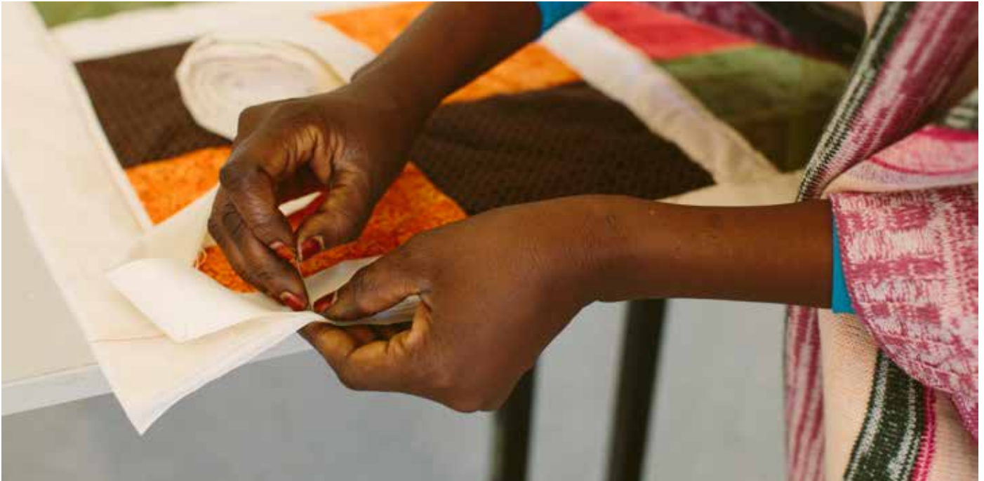
Multicultural Sewing Group, Kildonan Uniting Care, Shepparton, 2014

for the majority of residents in these cities, there were not enough opportunities for regular, meaningful intercultural interaction. There were several examples of small-scale activities in Shepparton and Mildura that brought people together and, due to the shared interest, helped overcome challenges such as language barriers, nervousness, or discomfort at meeting new people. Community and neighbourhood houses, and Men's Sheds, are the kinds of mainstream venues where such interactions might occur more often.