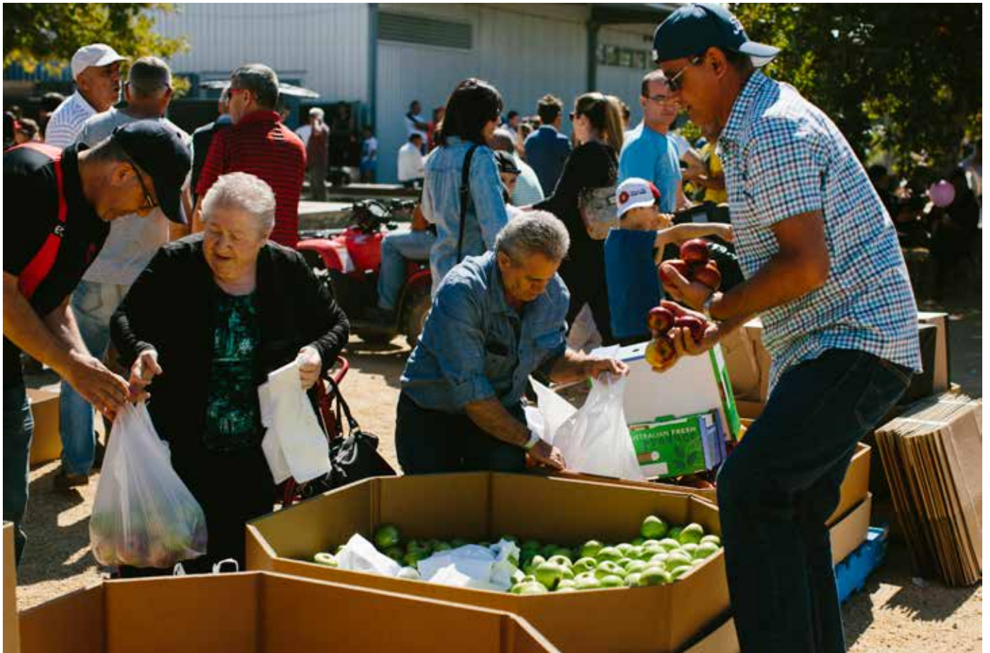
Albanian Harvest Festival, Shepparton, 2015

Prior to the emergence of the cities of Shepparton and Mildura, the Shepparton and Mildura areas had many Aboriginal tribes and clans who had lived there for more than 40,000 years. The traditional Aboriginal custodians of the Shepparton area are the Bangerang and Yorta Yorta peoples. The Mildura area's enduring Indigenous population includes the traditional custodians the Barkindji, Latje Latje, Paakantji (Barlindji), Ngayampana, Mutthi Mutthi, Wemba Wemba, Tati Tati and Barapa Barapa peoples (see Mallee District Aboriginal Services [MDAS] Website http://www.mdas.org.au ). These traditional owners are an important part of the culturally diverse social fabrics of Shepparton and Mildura, whose experiences and contributions are being gradually acknowledged by those who have migrated to the areas over the last 160 or so years.