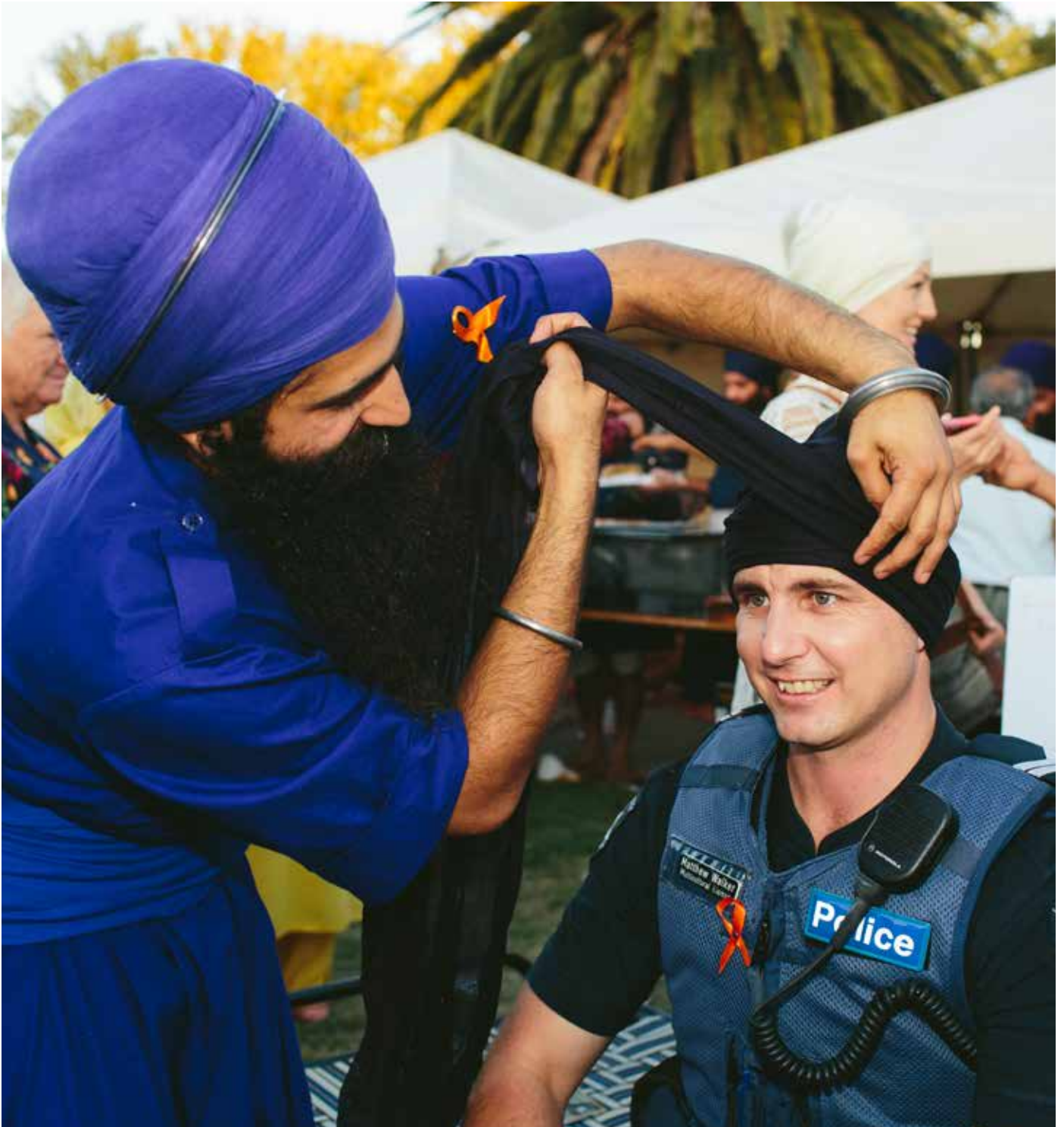
Shepparton Police Officer at Emerge at Twilight Festival, Shepparton, 2015