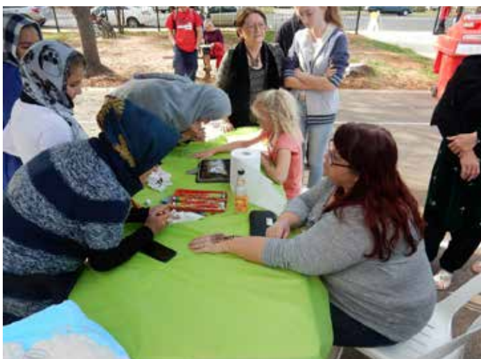
Afghan Henna Tattooing Stall, SMECC Open Day, Mildura, 2015

with statements like ‘Sikhs and Anzacs’. The crowd at Memorial Park was more ethnically mixed than that observed earlier at the Dawn service. There were Afghani men, people from African backgrounds, Muslim women wearing headscarves. During the speeches Greek, Sikh and Indigenous soldiers were singled out for special mention. The wreath laying ceremony involved the calling out of names of groups and individuals as they came forward with their wreaths. Among the armed services groups, schools, service clubs, emergency services and other agencies called out were noticeable examples of representatives of older and newer immigrant groups such as the GV Afghan Association, Shepparton Sikhs, the Australian Greek Ex-Servicemen’s Association, the Greek Community, Shepparton English Language