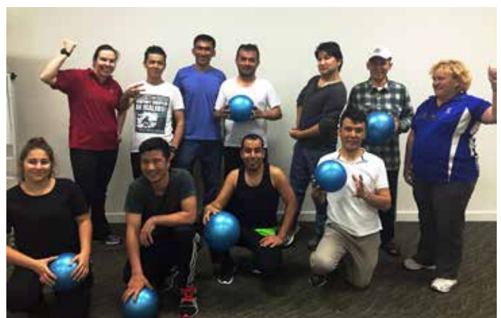
SMECC Men’s Exercise Group with Sunraysia Community Health Services

Not-for-profit welfare agencies such as Mallee Family Care (MFC) in Mildura and Family Care in Shepparton have a range of services to the community with a focus on families, children and youth, disability and mental health, and housing, legal, and financial advice and support. Though they are mainstream agencies rather than specialising in CALD or Indigenous communities,