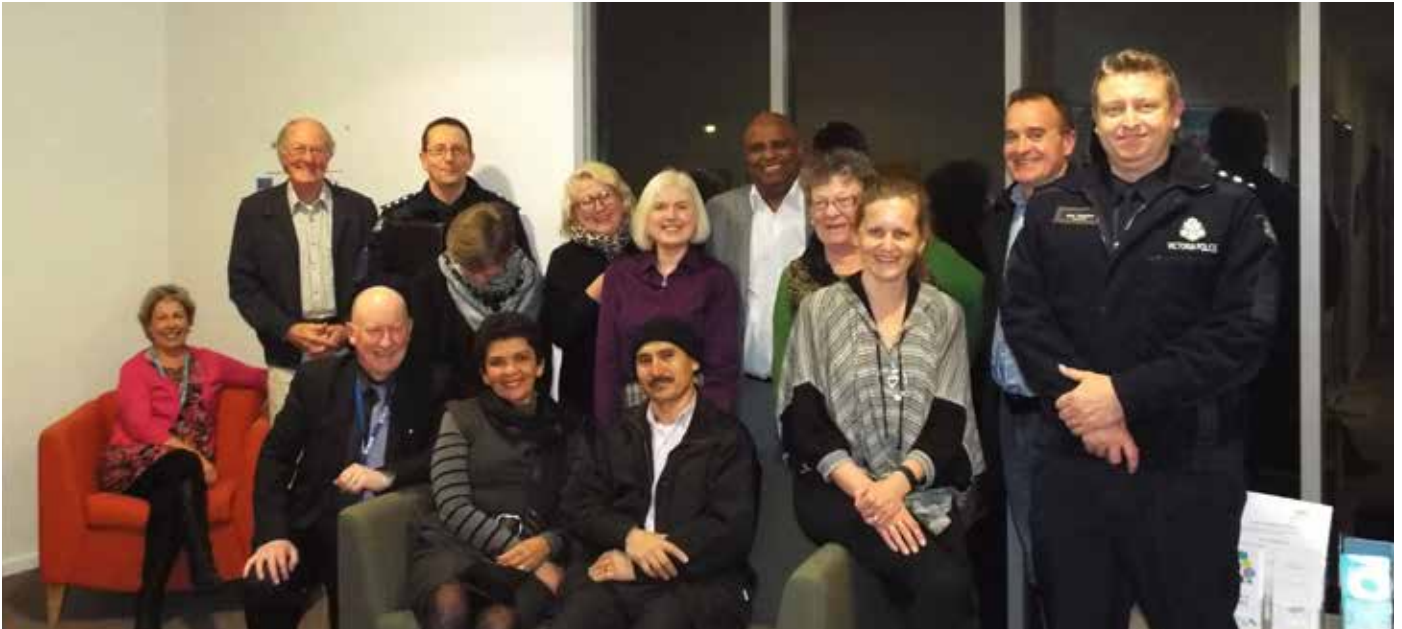
VMC Loddon Mallee Regional Advisory Council, Meeting in Swan Hill, 2015