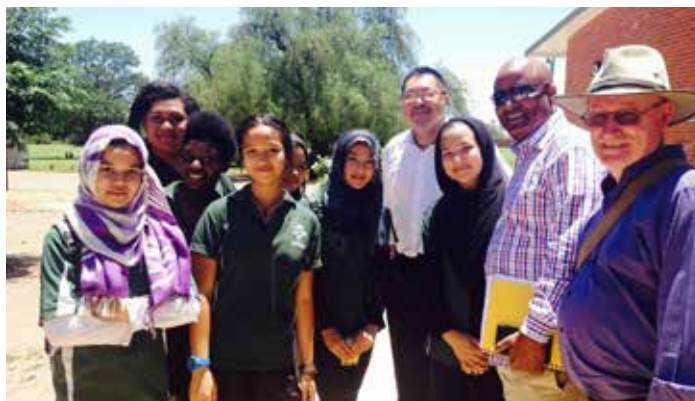
VMC Visit to Chaffey Secondary College, Mildura, December 2014

And then we have a music program too which just goes across all that. All the kids learned Polynesian dances, and they choreographed their own and we had a Polynesian fire night.