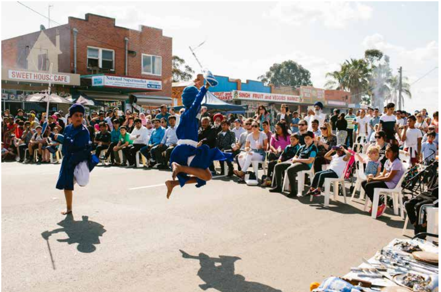
Martial Arts Display by Sikh youth, St. Georges Road Food Festival, Shepparton, 2015

It was estimated that about 50% of Shepparton's Afghanis had arrived by boat in Australia and had experienced detention (Ethnic Council of Shepparton and District Inc. 2015b).