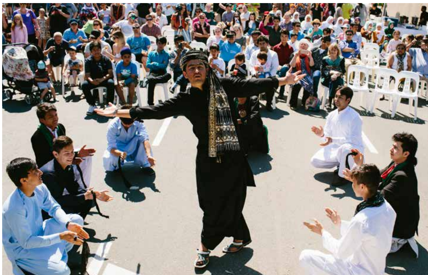
Afghani boys from Shepparton English Language Centre, dancing at St. Georges Road Food Festival, Shepparton, 2015

This issue of 'white flight' appears to be largely enabled by loose school zoning regulations. Parents are not bound by zoning rules in where they send their children to school in either Shepparton or Mildura. Another interviewee at