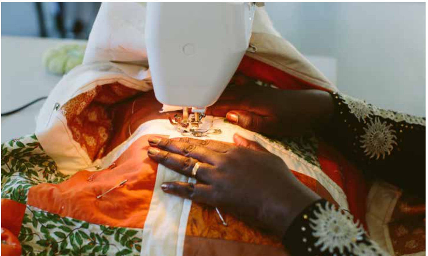
Multicultural Sewing Group, Kildonan Uniting Care, Shepparton, 2014

Interpersonal interaction between people from differing cultural backgrounds is a crucial element of social cohesion because it fosters opportunities to build trust, identification with the community, social networks, and mutual