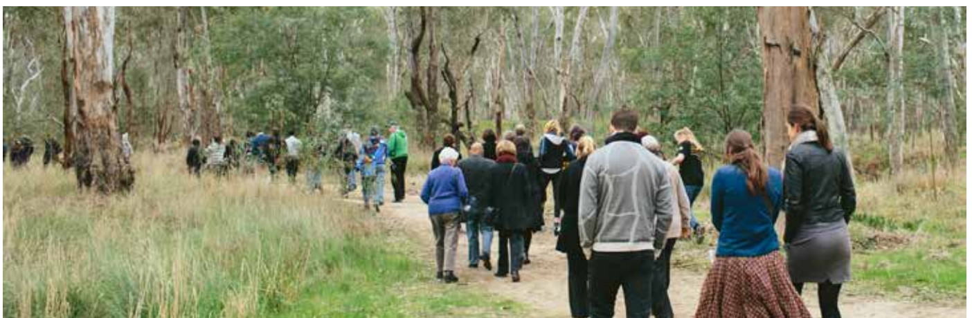
Walking Tour of the River Flats between Mooroopna and Shepparton, led by Aboriginal Elder, NAIDOC Week, 2015