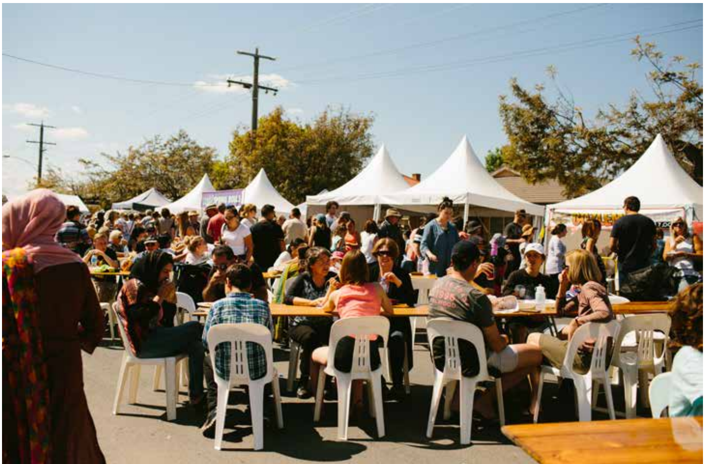
St. Georges Road Food Festival, Shepparton, 2015

Events celebrating multiculturalism and diversity of cultures are sometimes criticised by researchers and other commentators for the tokenistic display of cultural traditions, or because they are seen as discrete, one off events. Our research suggests a far more positive view of these community events. Such events are popular occasions for people to share culture, in particular food, and provide opportunities for recent and older immigrant groups, and also local Indigenous communities, to publicly express their presence in Shepparton and Mildura. They also provide opportunities for enjoyable, safe engagement with the cultures and traditions of people who may otherwise seem very unfamiliar. People have opportunities to share culture through such communally organised events. Improving people's awareness of and understanding of diversity and difference present in their own local communities is a major driver of all dimensions of social cohesion (Dandy and Pe-Pua 2013, p. vii). Community events, including events that are not specifically organised