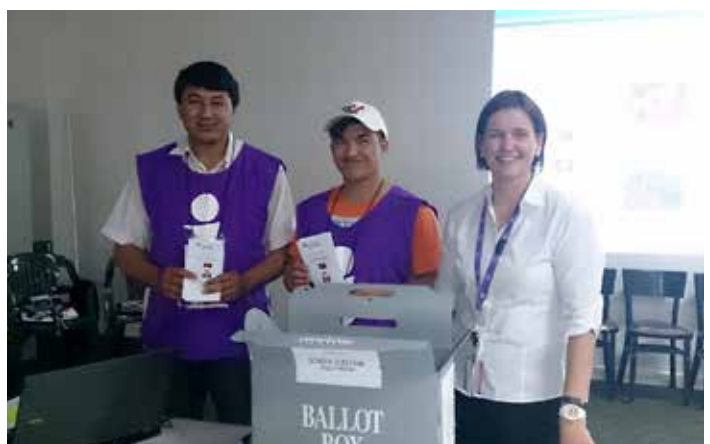
How to Vote Information Session, Mildura, SMECC

Other government agencies make important contributions to social cohesion in multicultural environments, and in environments marked by inequalities, including socio-economic inequalities. The focus of such agencies and their programs should be firmly on building the resilience of multicultural communities, especially those that are highly disadvantaged. Recent arrivals from CALD backgrounds in particular should be made aware of the role and functions of these different agencies, such as VMC, OMAC, DHHS, and Centrelink, as well as local government. At the same time, they should be made aware of their responsibilities as citizens, and encouraged to embrace Australia's laws and democratic values.