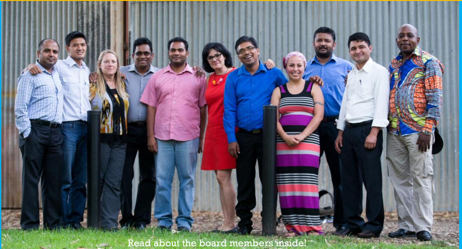
Read about the board members inside!

newsletter of the albury-wodonga ethnic communities council inc.